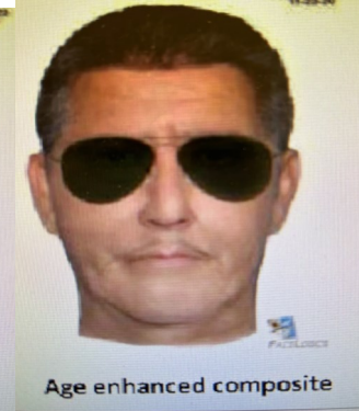
Age enhanced composite