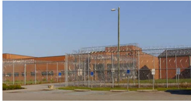
Alvin S. Glenn Detention Center

More often than not, our young adults need support and strict guidance to get back on track.